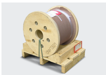
Wooden reel on pallet