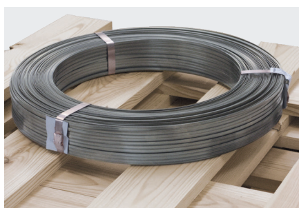
Reel without core